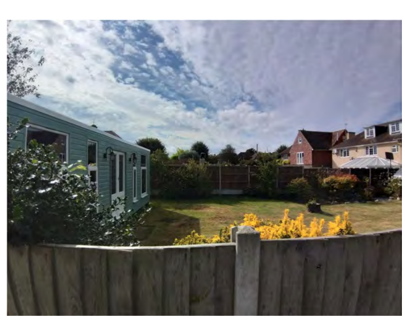
The neighbouring garden to the south