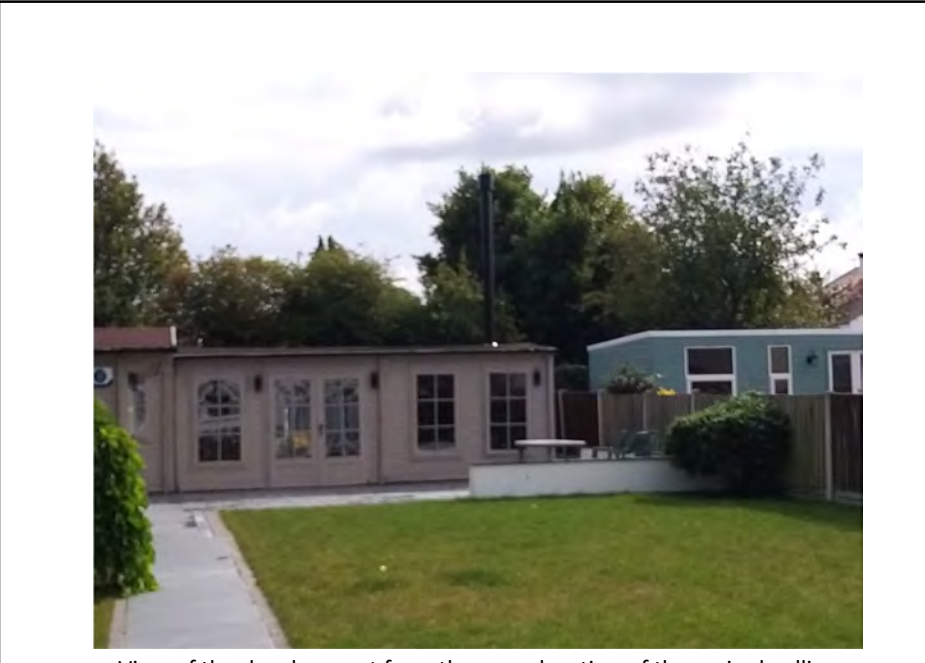
View of the development from the rear elevation of the main dwelling