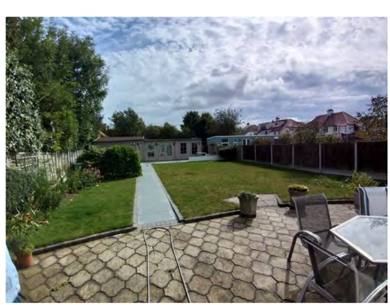
View of the development from the rear elevation of the main dwelling