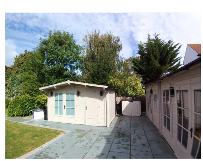
View from the location of the development towards the north