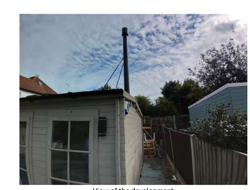
View of the development