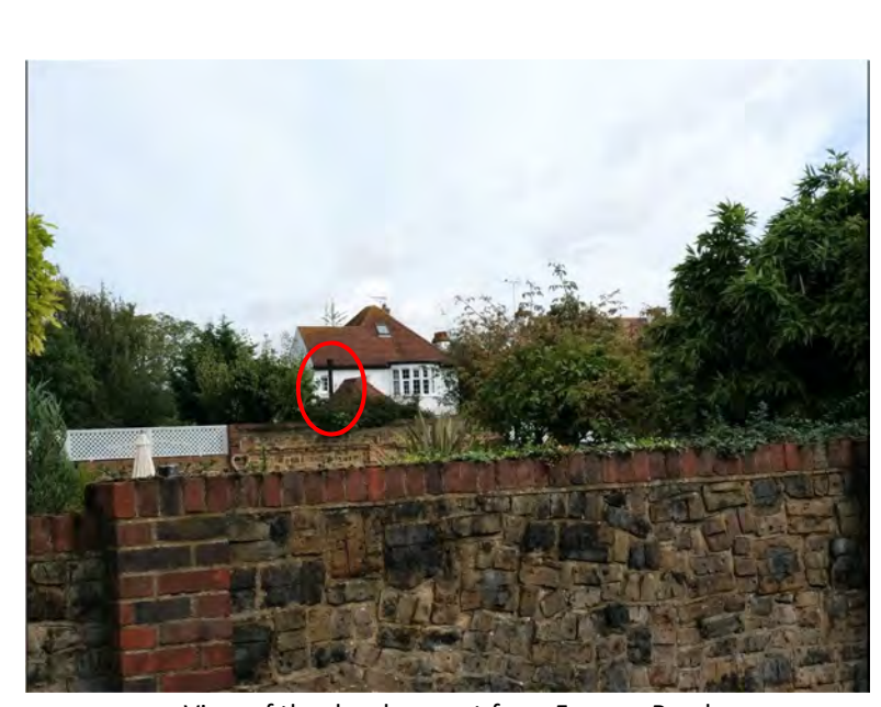
View of the development from Fermoy Road