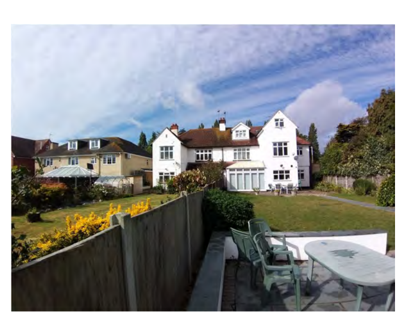
The site (right) and the neighbouring properties to the south.